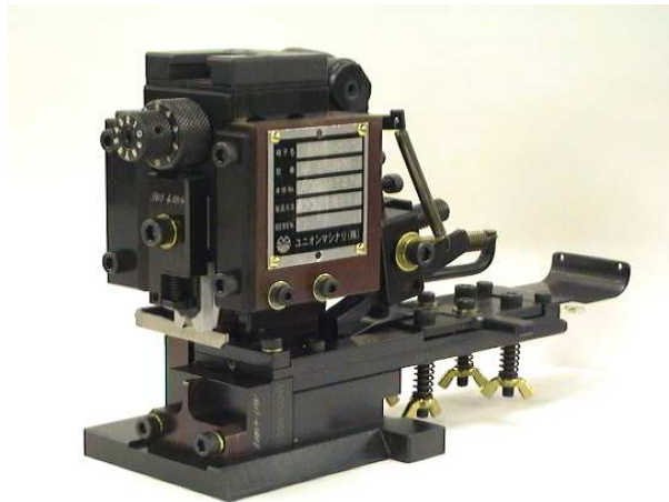
AA13 Type (End feed)